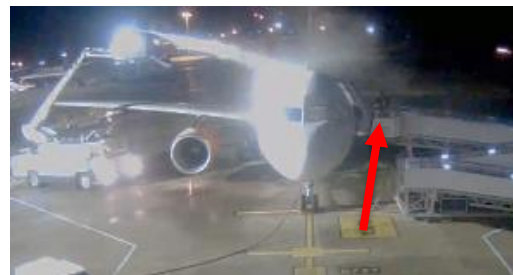
Pilot sprayed with de-icing fluid